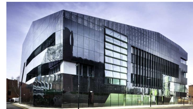
National Graphene Institute, Manchester, UK

University of Manchester: Graphene Coating